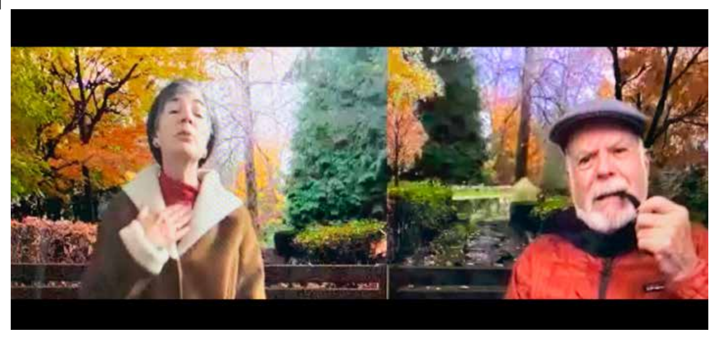
Two electronic backgrounds made it look like the actors were on the same park bench in Just a Song at Twilight

an in-house channel or another online service. The process is more complex with filming and editing, but actors love it because they can do several "takes" to get it just right.